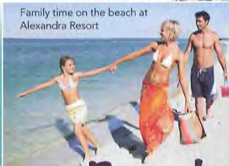
Family time on the beach at Alexandra Resort