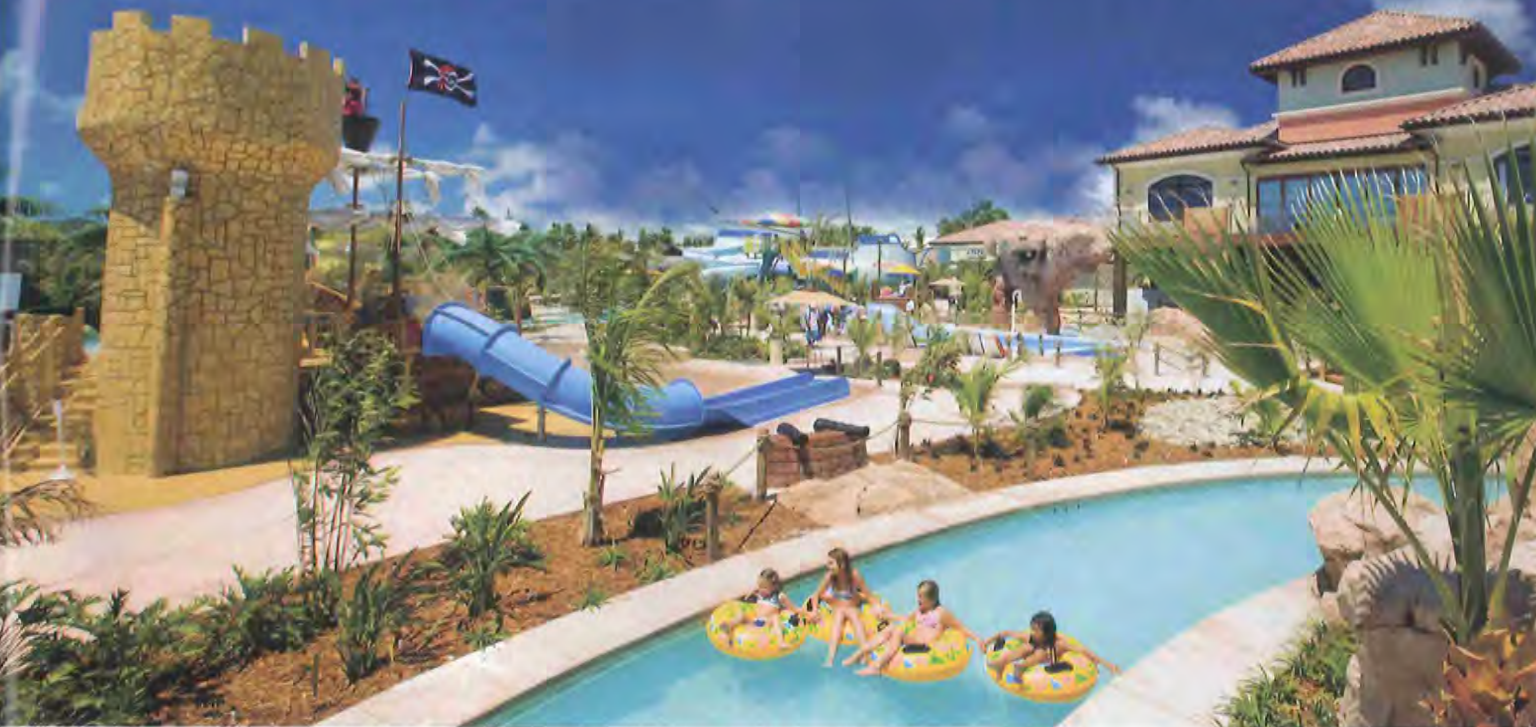
Above: Water activities at Beaches in Turks & Caicos